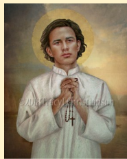
San Lorenzo Ruiz

Join our celebration as we honor the Filipino Saints