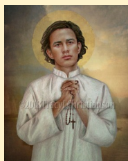
San Lorenzo Ruiz

Join our celebration as we honor the Filipino Saints