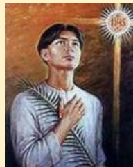
San Pedro Calungsod