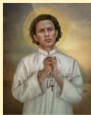
San Lorenzo Ruiz

Join our celebration as we honor the Filipino Saints