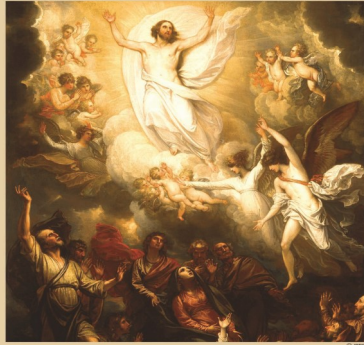
"He ascended into heaven, and is seated at the right hand of the Father."