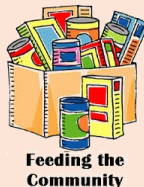
Feeding the Community

Please consider donating food to the Food Pantry for the coming holiday season. You can drop off the food items at the Parish Center (1211 Orange Ave.) Thank you for your generosity.