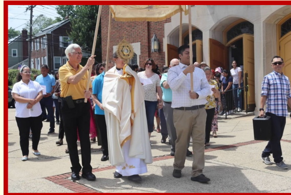
June 02, 2024 : Corpus Christi Procession