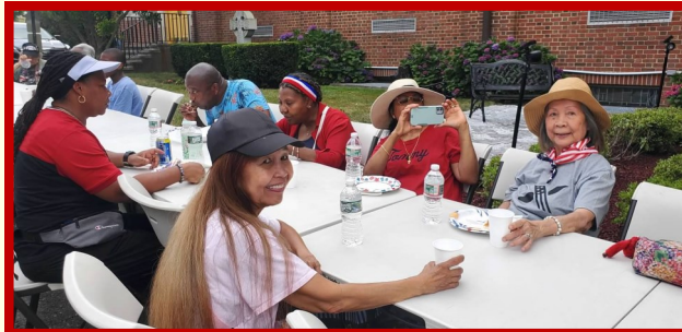
July 04, 2024 : Hang out & Fireworks Family night!