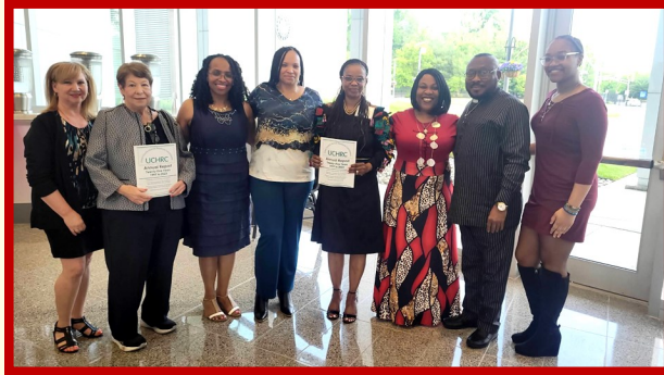
May 13, 2024 : Hands of Grace Ministry (HUGS) was honored this year the Unity Achievement Award by the Union County Relations Commission.